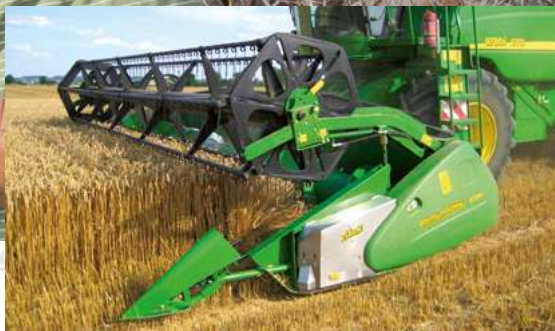
The 2005 silver medal for the superior header

The impressive technology of the PREMIUM FLOW header was awarded a silver medal in 2005 and the electrically-driven ZÜRN i-FLOW a silver medal in 2015.