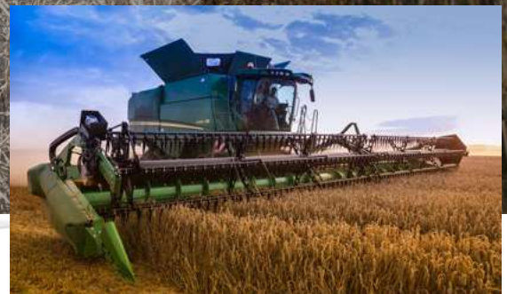
The 2015 silver medal for the intelligent header

PREMIUM FLOW presents a significant upgrade to existing belt header technology, and has earned ZÜRN a silver medal.